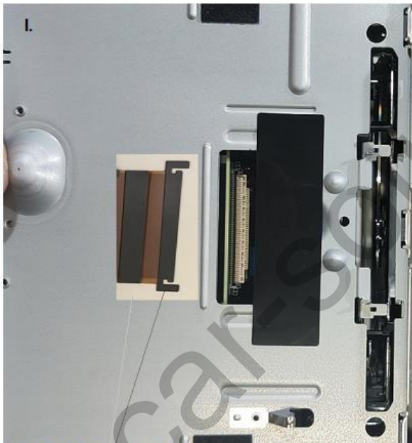
I. Insert the flat cable to the terminal of head unit as photo ,pls connect carefully and fixed it very stable

Interface module undercut the head unit metal part as photo above. This way flat cable direction is fixed .