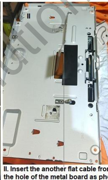
II. Insert the another flat cable from the hole of the metal board as photo