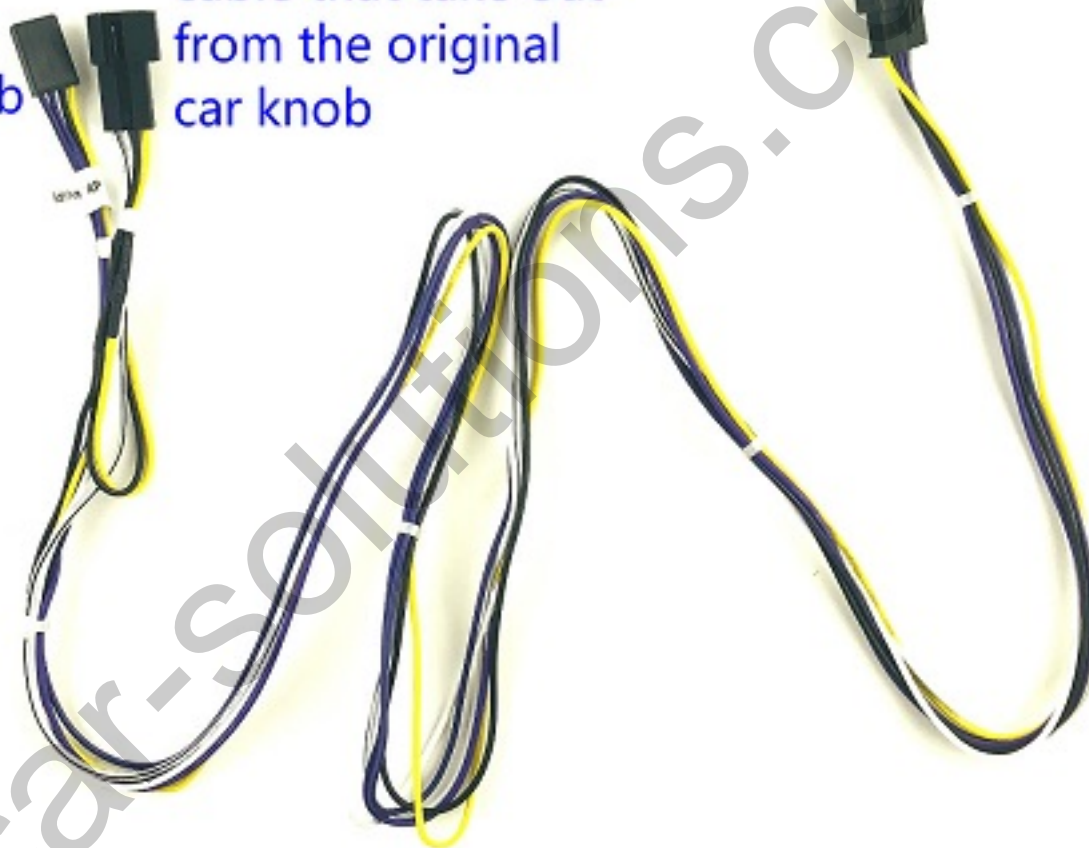
Idrive 4PIN Knob convert cable