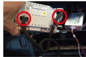
3. Unplug the LVDS video connector at the rear of car display, and connect it to Interface cable.