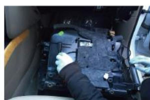
6. User can fasten the interface in glove box.