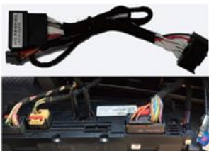
5. Find CANBUS connector at the rear of Climate controller, Plug&Play with Interface support.