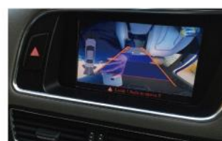
7. Performance of interface. (Displayed when shift into Reverse gear).