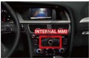
1. AUDI A4/Q5/A5 INT-MMI Parking assistance system Retrofit.