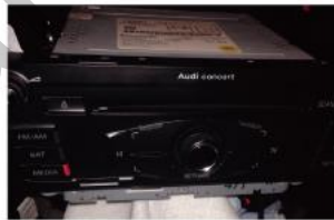
2. Make sure it is Concert or Symphony radio before installation, but no need to take out of it.