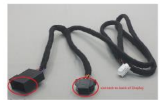
4. Original LVDS connect to interface cable, and connect the other end of interface cable to car display.