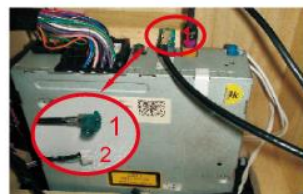
3. Insert Interface LVDS connector ① to head unit, connect white plug ② to interface.