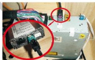
2. Unplug the LVDS video connector at the rear of main unit, and connect it to Interface.