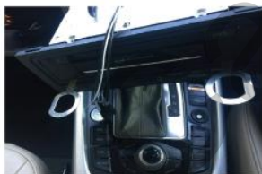
1. Take out of Main unit with car special removal kits.