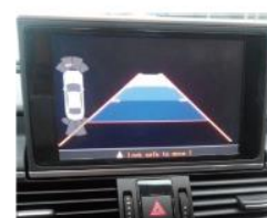
7. Performance of interface. (Displayed when shift into Reverse gear).