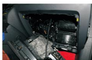
6. User can fasten the interface in glove box.