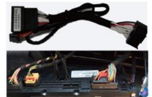
4. Find CANBUS connector at the rear of Climate controller, Plug&Play with Interface harness.