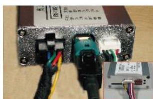
5. Connect interface cables as per the pic. (LVDS at the rear of main unit to Interface, and LVDS from interface to its original position)