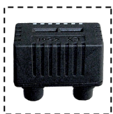
Capacitance Ext Module