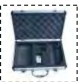
Metal Case (optional)