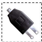
5V, 1KHz Output