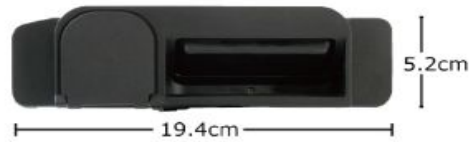
1. MercedesBenz CLA,C Class