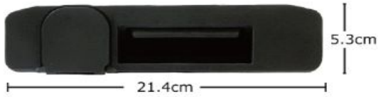
2. MercedesBenz ML,GL,GLE,GLC,GLA,A Class