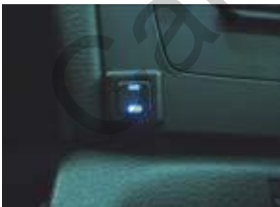
TV FREE MODE