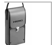
9399 CARRYING CASE