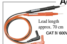
9207-10 TEST LEAD