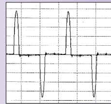
Current waveform of the inverter (primary side)