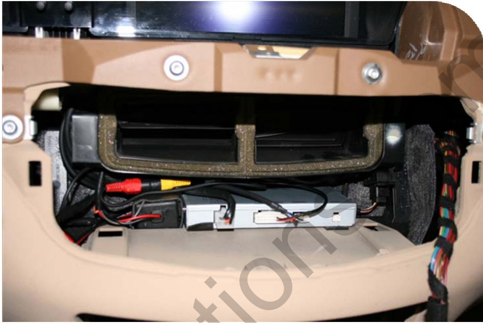
Picture of car interior installed