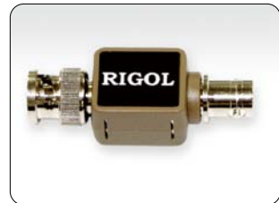
40 dB Attenuator