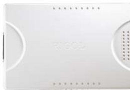
Logic Signal Output Module

With the Logic Signal Output Module, RIGOL DG3000 series is the worldwide first Mixed Signal Generator (MSG) featuring 16 digital data channels and 2 clock channels.