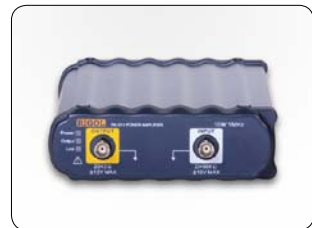
10W Power Amplifier PA1011