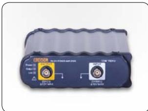
10W Power Amplifier PA1011