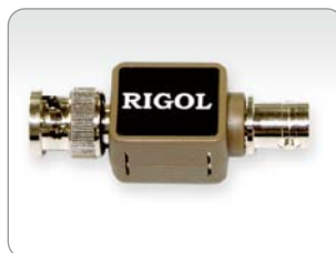
40 dB Attenuator